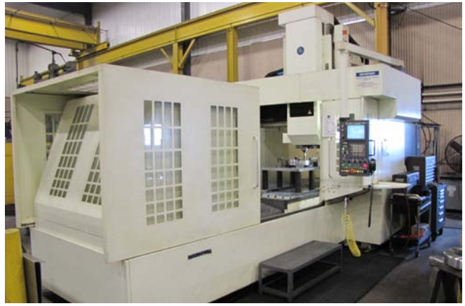
The Kitamura CNC Bridge Mill allows for large part and weldment machining.