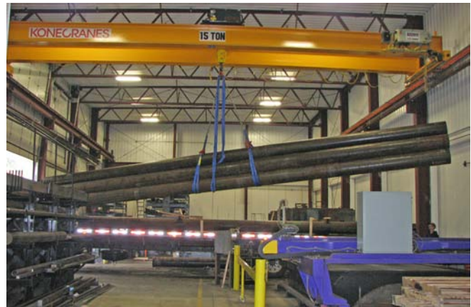
Throughout our facility, we have a total of eight cranes that range from 15 to 30 ton capacity.