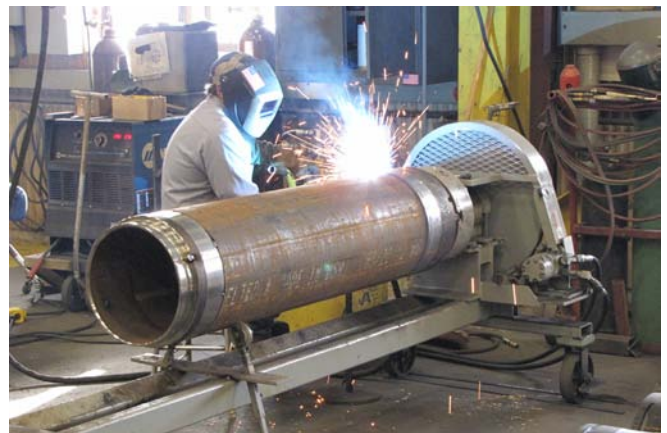
Our welders utilize both Heavy and Light Mig Arc-Wire-Feed Welding.