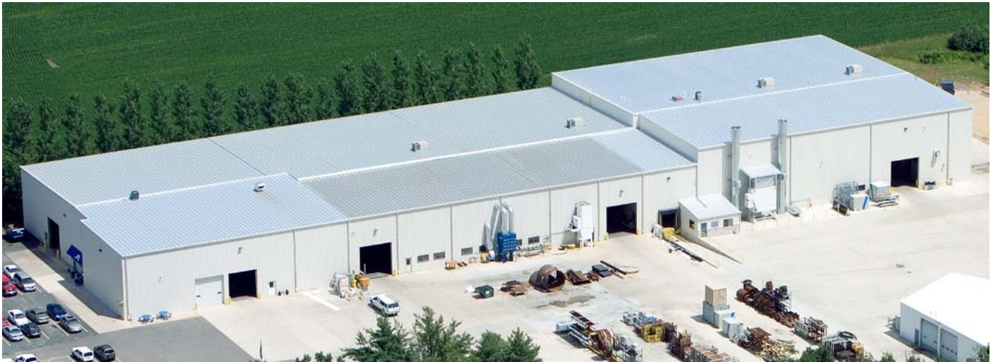
Shown above is our 65,000 SQ FT Manufacturing Facility located in Brownsdale, MN.