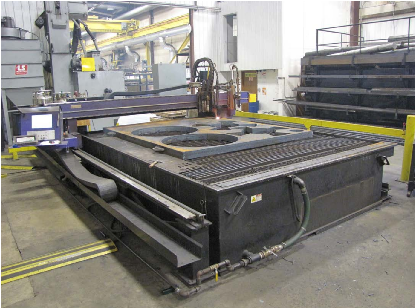
Our Flame Cut Table features a plasma torch and Oxy Acetylene for Superior Cutting Quality.