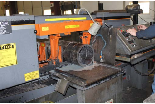
An operator controls the HE&M Horizontal Pivot Band Saw as it makes a straight cut with ease.