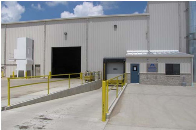
Here is our loading bay, one of the numerous areas that we have for loading and unloading.