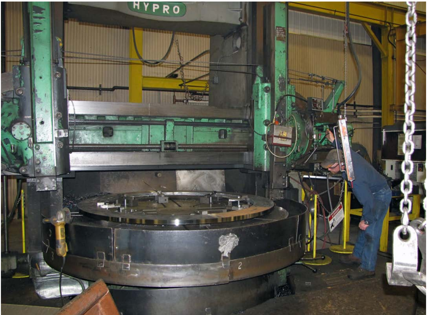
The Cincinnati Hypro Boring Mill turns raw materials at speeds that range from 1.1 to 43 RPMs.

“Heavy Weldments with Machining our Specialty”